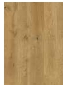
520 Autumn Amber