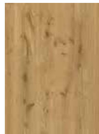
510 Summer Blonde