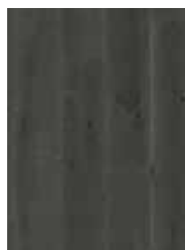
780 Matt Black