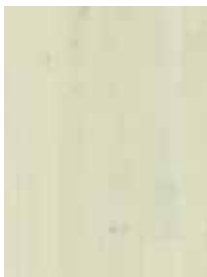
100 White Sands