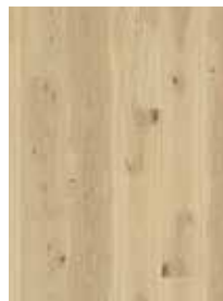
500 Alpine Oak