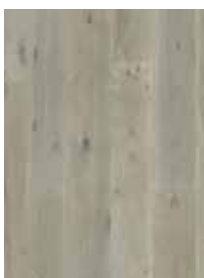
750 Silver Finch