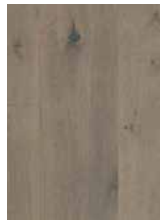
750 Silver Finch