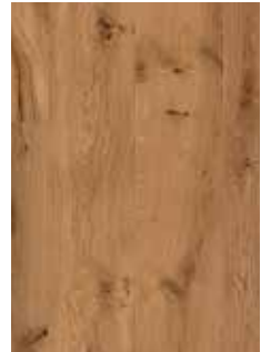
510 Summer Blonde