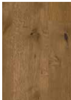
520 Autumn Amber