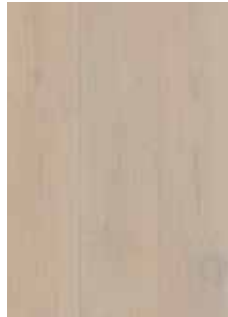
100 White Sands