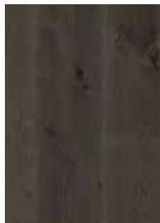
780 Matt Black