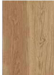
500 Alpine Oak