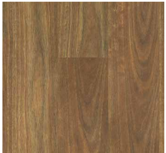
555 Spotted Gum