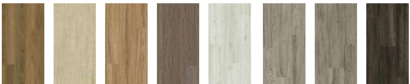
555 Colonial Spotted Gum 560 High Street 625 Marble Arch 640 Fleet Street 710 Lancaster 730 Notting Hill 750 Kensington 780 Oxford