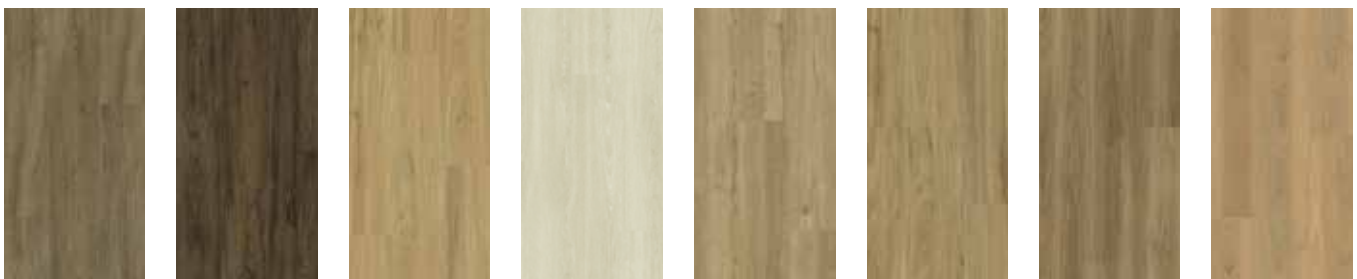
180 Mayfair 185 Camden 350 Paddington 510 Westminster 520 Park Lane 530 St James 540 Imperial 545 Colonial Blackbutt