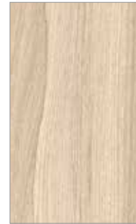
0500 ROSE GOLD