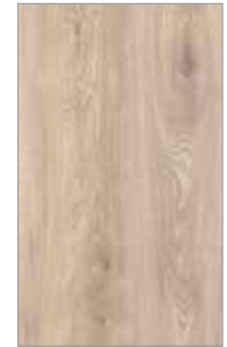
0520 TOI TOI