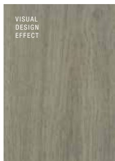
720 Reclaimed Oak