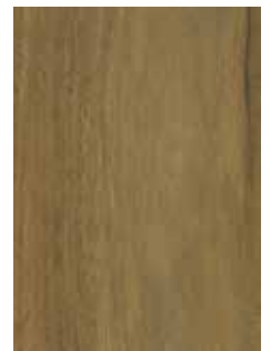
555 Spotted Gum