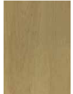
525 Alpine Gum