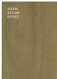
540 Natural Fumed Oak