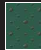
2201/77 Arlington Cross