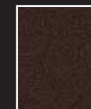
2193/86 Canyon Sand