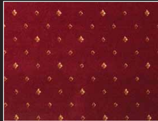
2182/82 Merlot Weave

*Test certificates available upon request.