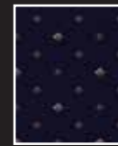
2188/83 Napolean Weave