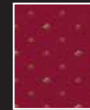
2184/82 Merlot Weave