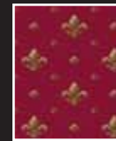
2183/82 Merlot Lily