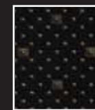
2191/0 Tekapo Image