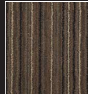
C071127 A Scepter