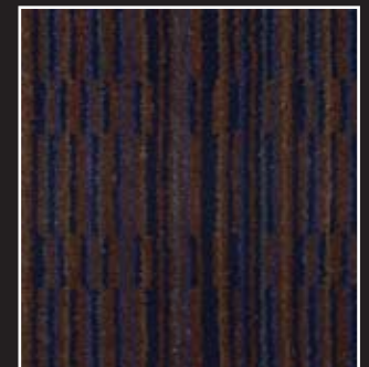
C071128 A Indigo