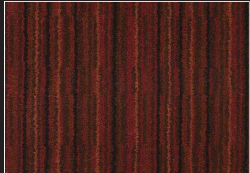
C071129 A Jazz