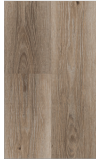
0300 COASTAL BLONDE