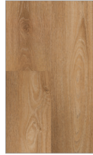
0350 SOUTHERN HUE