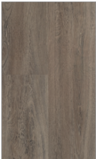
0700 STORMY GREY