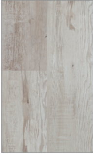
0100 ICE WHITE