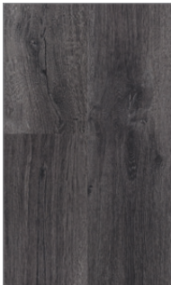
0790 IRON SANDS