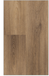
0520 NATURAL STONE