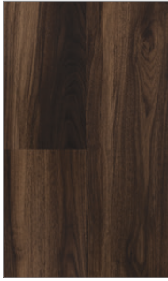
0180 RUGGED EARTH